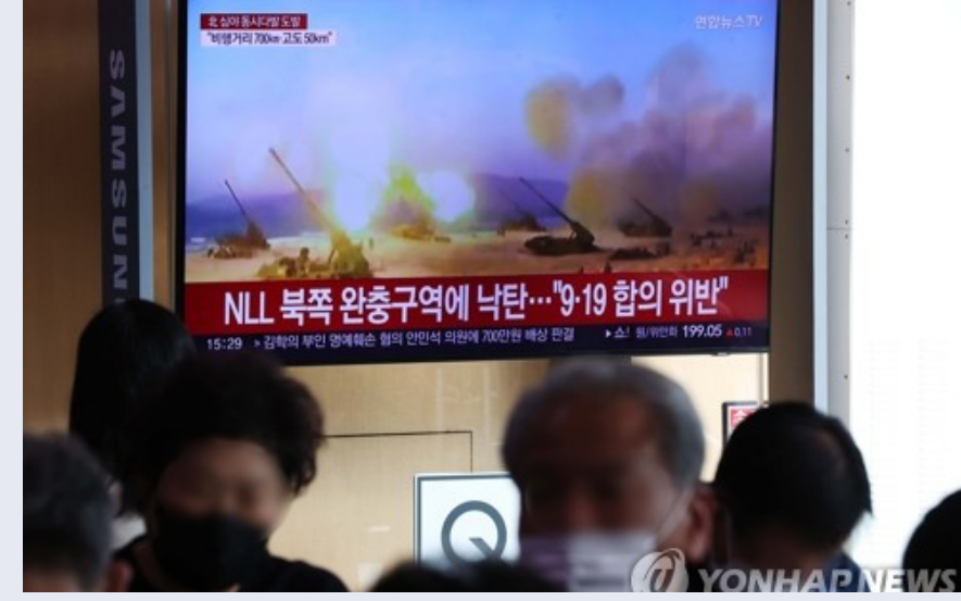
Yoon's office says fate of inter-Korean agreement depends on N. Korea

Ex-vice Gyeonggi governor indicted for taking bribes from underwear maker