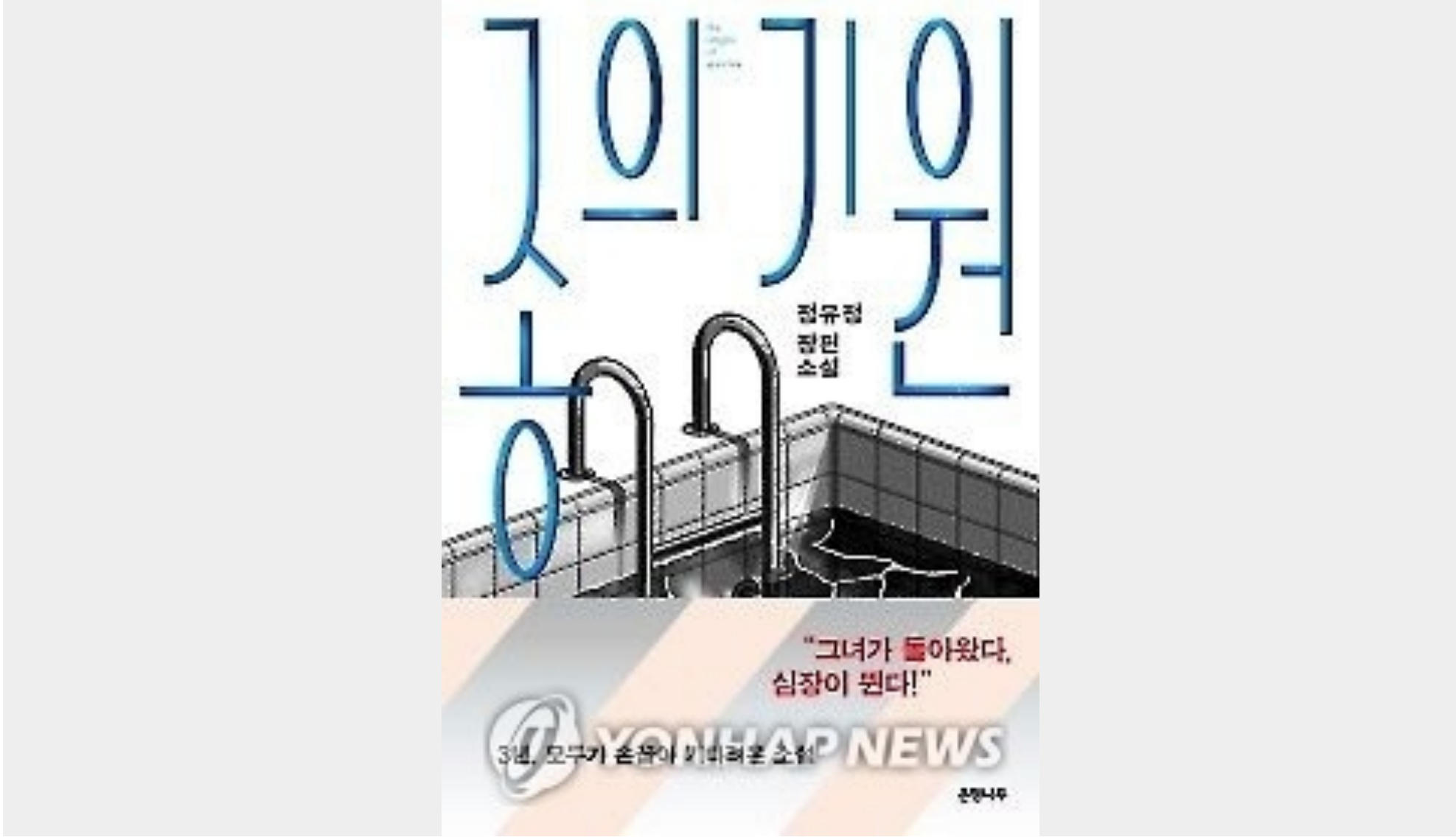
The cover for Jeong Yu-jeong's "The Origin of Species"

Barbara J. Zitwer Agency, a global literary agency based in New York that is closely working with the KL, will introduce the book at the Frankfurt Book Fair slated to open next month.