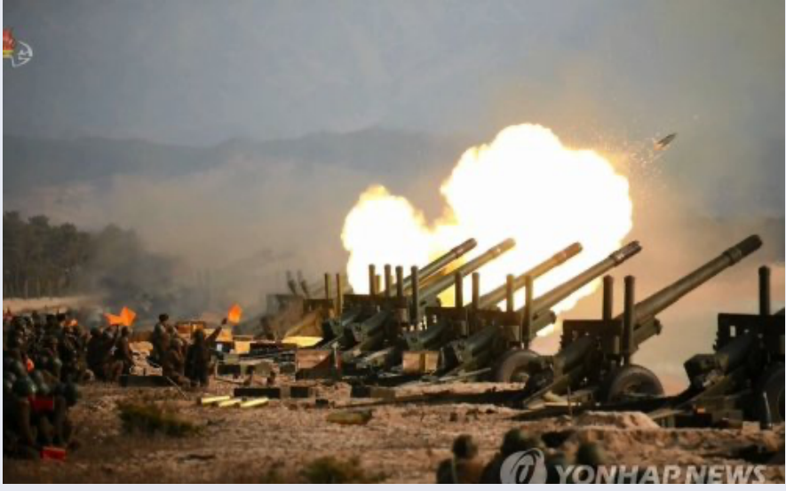
N. Korea lobbs coastal artillery shells into Yellow, East Seas: S. Korean military